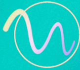
soulmates by heaven