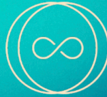
heaven loop pro